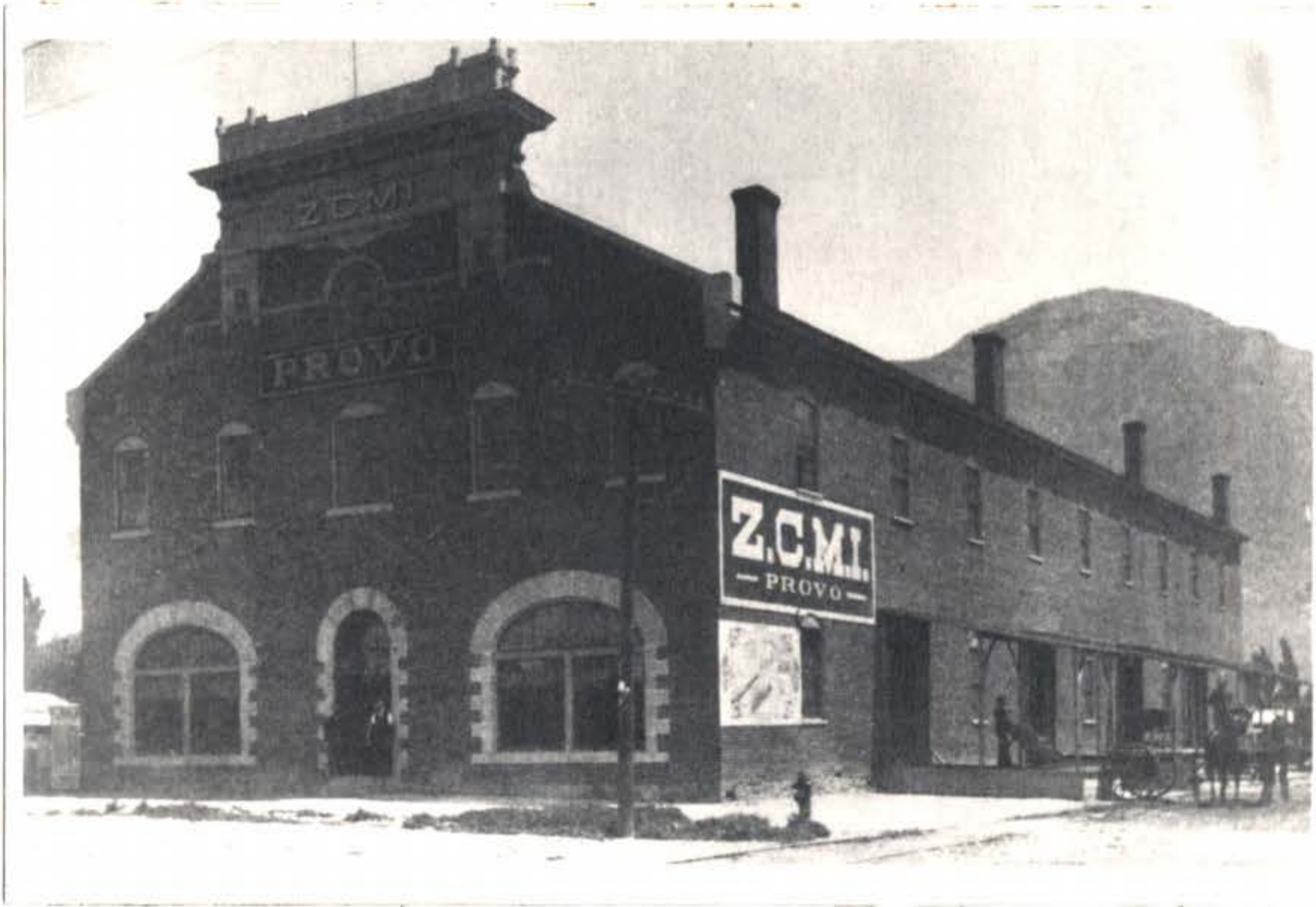
THE Z. C. M. I. WAREHOUSE