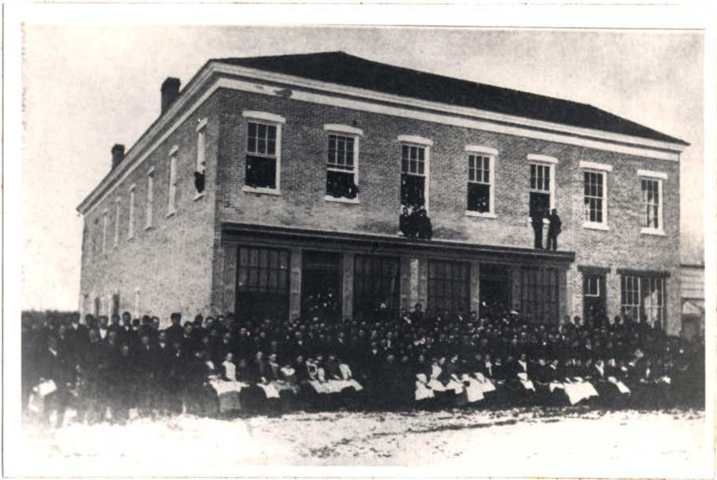
THE LEWIS BUILDING